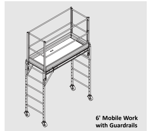
6' Mobile Work with Guardrails