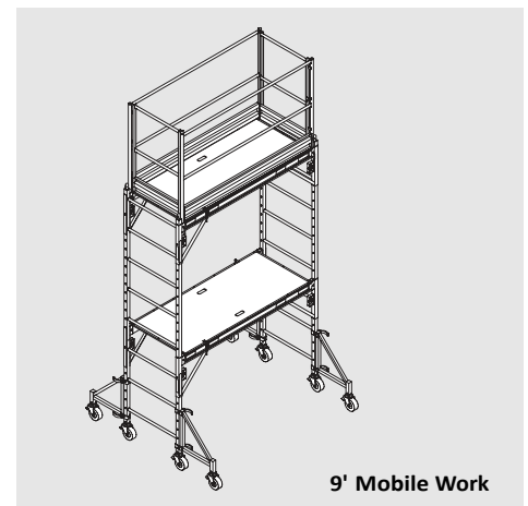
9' Mobile Work