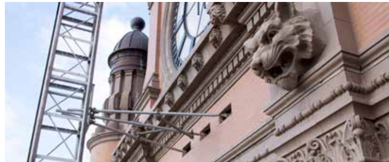
The wedge anchors allowed the erectors to continue building upward while the epoxy anchors cured.

appropriate height, the extension could be rolled sideways along the length of the platform to the needed position. Once in position, the extension was then lowered to horizontal with a manual winch. To complete the system, two additional hook-on platforms were attached, one at the end of the extension reaching behind the gable and one continuing in front. This allowed one worker to stand safely on each side of the cap unit to lift and replace the heavy pieces of terra-cotta. There was also an extension added to the back of the MCWP to allow for a portable toilet and a full-size job box.