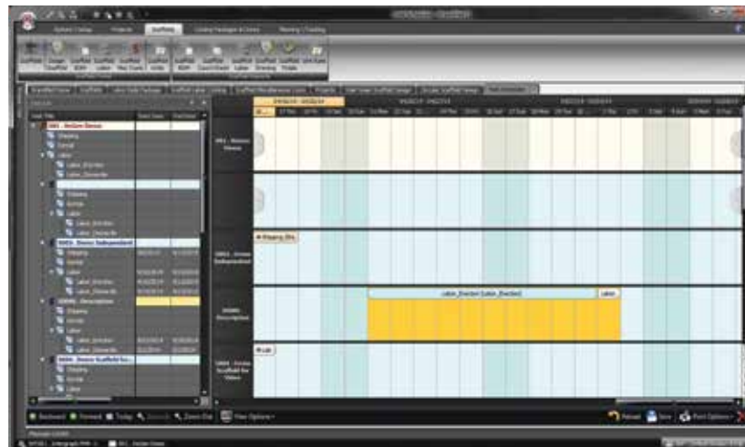
^ Estimating | Planning | Scheduling