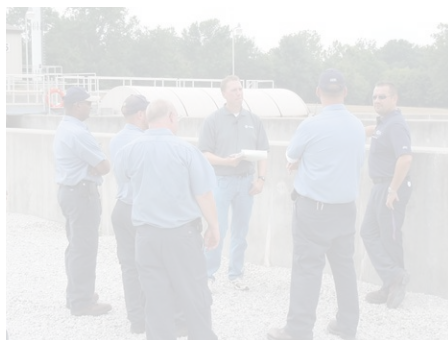
The Aqua-Aerobic Customer Response Center is now open 24/7.

LOVES PARK, Ill. — The Aqua-Aerobic Customer Response Center is there for you from process start-up to aftermarket products and services, providing complete plant assistance with a professional staff. Whether it's an emergency requiring a service technician on-site, a replacement part shipped overnight, or technical support via phone or email, Aqua-Aerobic's national network of service staff and product distributors ensures prompt and reliable assistance when you need it.