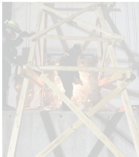
The Texas A&M Engineering Extension Service has been selected by FEMA to develop and deliver curriculum for Urban Search and Rescue training and exercises.

COLLEGE STATION, Texas — The Texas A&M Engineering Extension Service (TEEX) has been selected by FEMA to develop and deliver curriculum for Urban Search and Rescue (US&R) training and exercises for 5,800 members of the National US&R Response System.