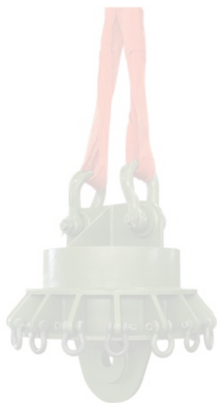
Lifting Gear Hire's Collector Rings.

BRIDGEVIEW, Ill. — Lifting Gear Hire's Collector Rings are used for lifting domes or circular tanks up to 150 tons. The Collector Ring comes with slings and