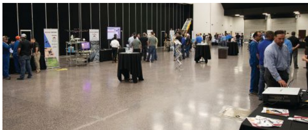
At BrandSafway's Innovation Day event, more than 75 attendees learned about new products and services like BrandTech™ Precision Welding, Flex-Deck and the Spider® one-person knock-down basket.

For more information, visit www.brandsafway.com or call (800) 558-4772.