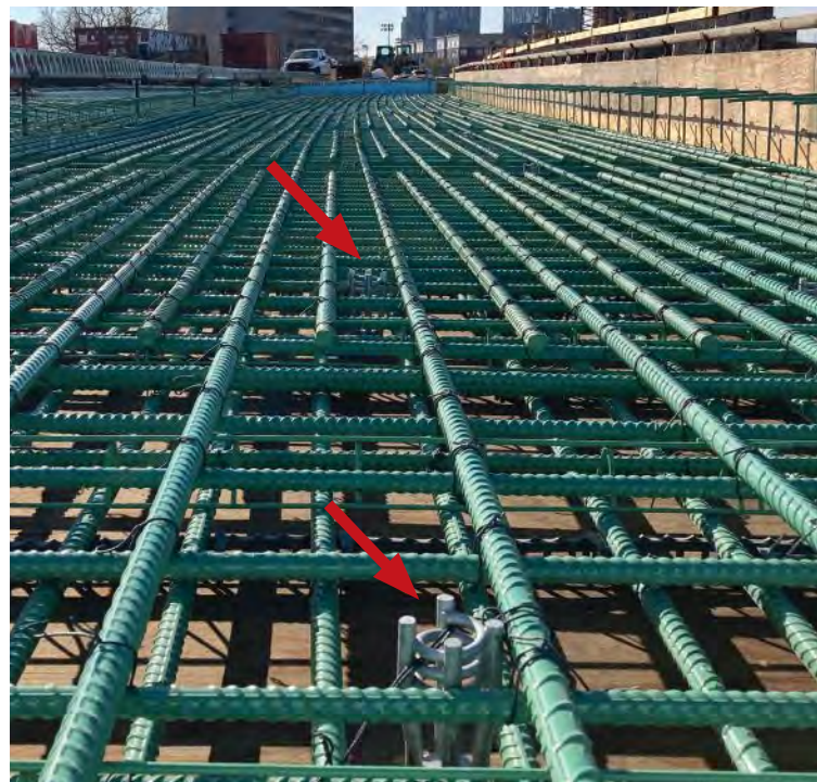
Figure 2. Embedded concrete inserts (indicated with arrows) are secured to the deck slab reinforcement with wire ties before placement of the new Tenth Avenue Bridge deck.

Because of construction schedule constraints, the existing bridge deck remained in place on span 5. In this instance, holes were drilled through the deck to allow suspension chains to drop through. Because concrete for the new deck in spans 3 and 4 was placed before the arch repair, the contractor was able to install 320 concrete embeds without having to drill holes for post-installed anchors in the new deck or in the spandrel caps. After the deck was complete, the RSP assemblies were attached to threaded rods installed in the embedments. The RSP assemblies and threaded rods were removed after work was complete, but the embedded inserts remain in the underside of the bridge deck for future access needs.