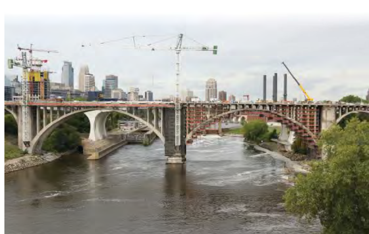
Figure 1. View of spans 3 to 6 of the Tenth Avenue Bridge in Minneapolis, Minn., looking north. Suspended platforms were used as debris shields on span 4 and for work access on span 5.

In the spring of 2020, the City of Minneapolis initiated the restoration project on the Tenth Avenue Bridge, which included replacing the bridge deck and concrete railing, patching piers and arches, replacing and patching deteriorated beams and spandrel columns, and applying corrosion-prevention treatment of the arch ribs and a new surface finish.