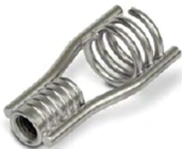
Figure 5. Proprietary concrete ferrule inserts are available from several manufacturers. Consult the specific manufacturer for capacities and installation requirements. For the Tenth Avenue Bridge project, the insert was threaded for 1¼-in.-diameter NC threads and had four struts instead of the two shown in this representative photo.

The concrete embeds add a small amount to material costs, take only minutes to install, and avoid issues such as interference with reinforcement and certain elements of supervised installation and inspection required for post-installed anchors (see the four-part series on post-installed anchors that started in the Summer 2020 issue of ASPIRE ® ). In this situation, by eliminating the time to drill and patch holes (about an hour per hole), the use of 320 concrete embeds translated to a savings of about $250,000 for the project and accelerated the work schedule.