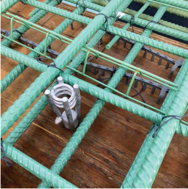
Figure 3. Using hundreds of embedded concrete inserts in the cast-in-place bridge deck eliminated hundreds of hours of labor to drill holes for post-installed anchors.