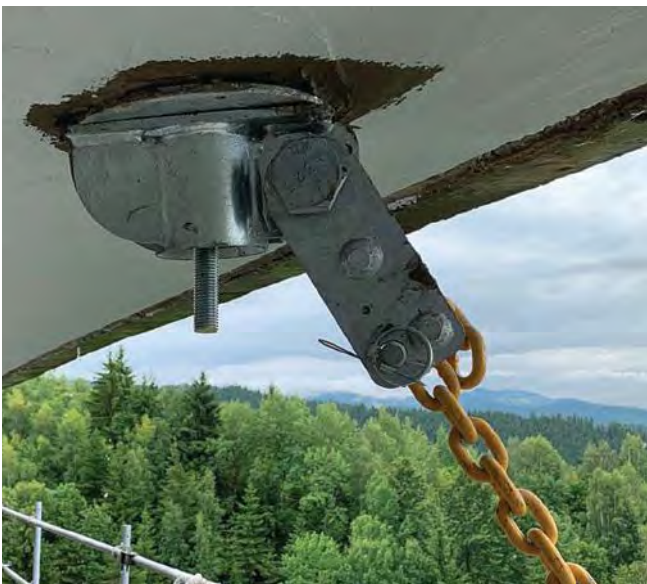
Figure 4. An innovative proprietary rotating-suspension-point assembly was used for the rehabilitation of the Caraçu Viaduct in Romania.